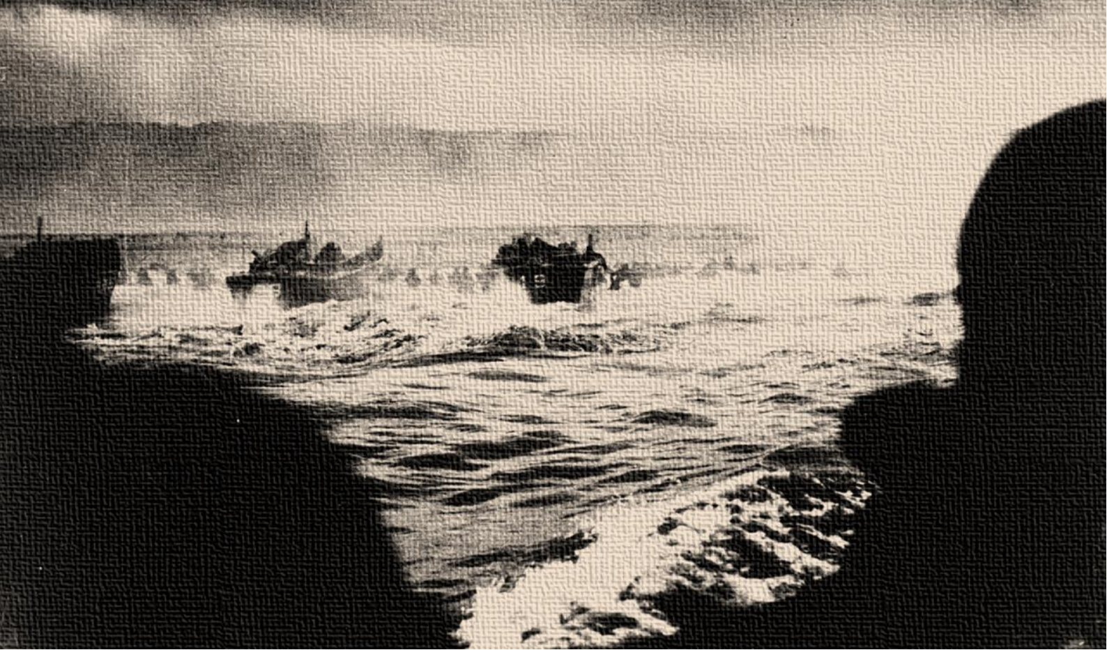
The first wave at OMAHA Beach on D-Day.