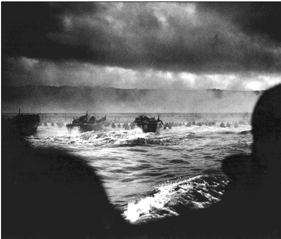
The first wave at OMAHA Beach on D-Day.