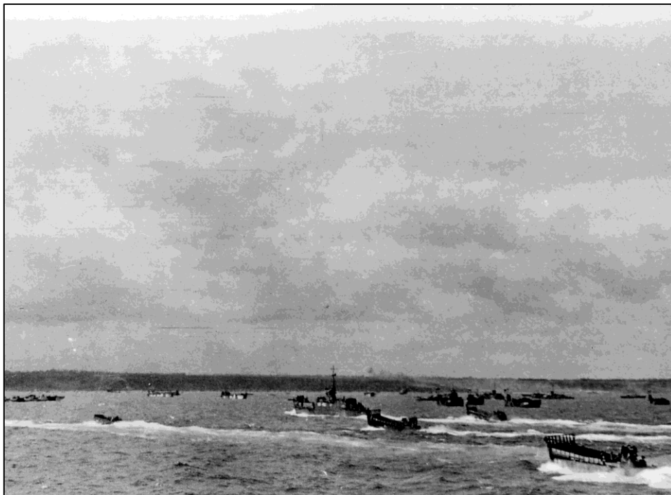
Landing craft approaching Omaha Beach on D-Day, 6 June 1944.